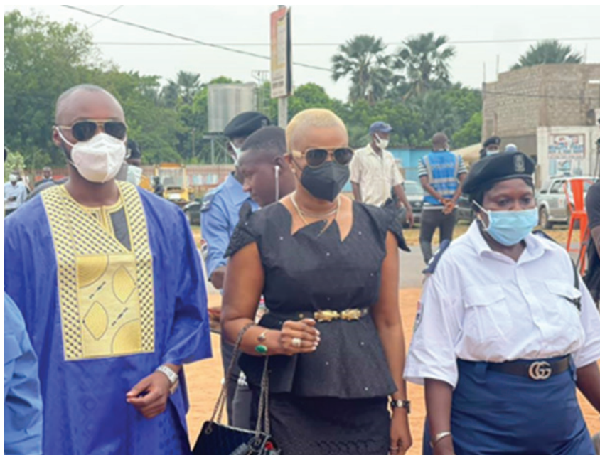
Independent Presidential Aspirant, Ms. Marie Sock Jobarteh