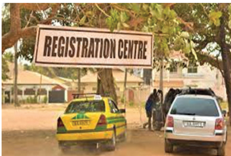
Monitoring team accompanied by the Chairperson in Upper River Region.

All registration centres monitored were fully operational daily, from 8:00 to 17:00, Mondays to Sundays. During working hours, Officials are allocated an hour break, from 13:30 to 14:30 every day. However, due to large tournouts, most centres did not observe breaks and some worked overtime to ensure that every eligible applicant was registered and issued a voter's card. Officials at Registration Centres such as Gambisara and Latrikunda Picadilly (Agriculture Centre), among others, indicated that they could not observe their daily breaks regularly due to the presence of large numbers of applicants.