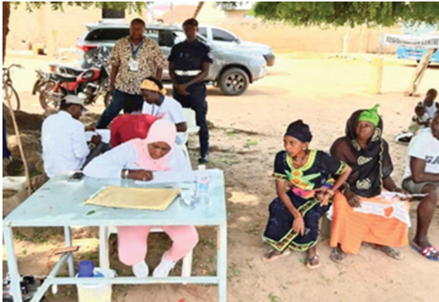
Monitoring team accompanied by the Chairperson in Upper River Region.