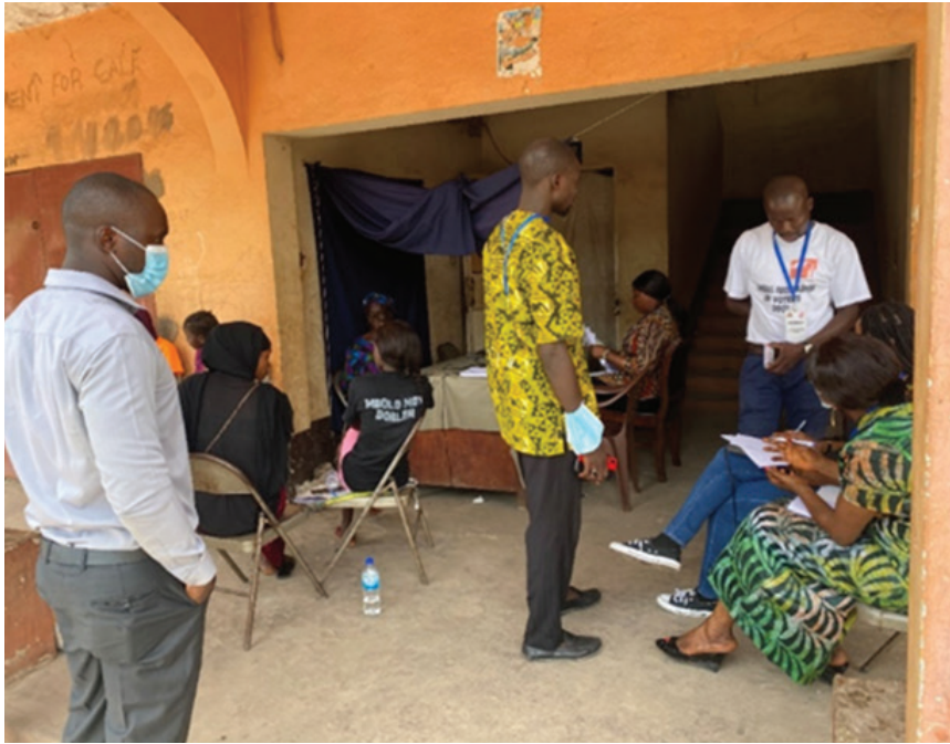
Monitoring Team led by Vice Chairperson at Odeon Square (Cinema), Banjul