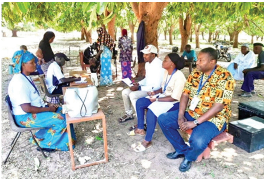
The Chairperson as part of the monitoring team in Upper River Region

There was compliance with the laid down voter registration procedures regarding eligibility for registration and as stipulated in the 1997 Constitution and the Election Act. The registration center supervisors were very much acquainted with the laws and the procedures which they strictly followed. This was confirmed by the political party representatives in all the centres visited. It was observed that the entire registration process takes, on average, about 5 minutes.