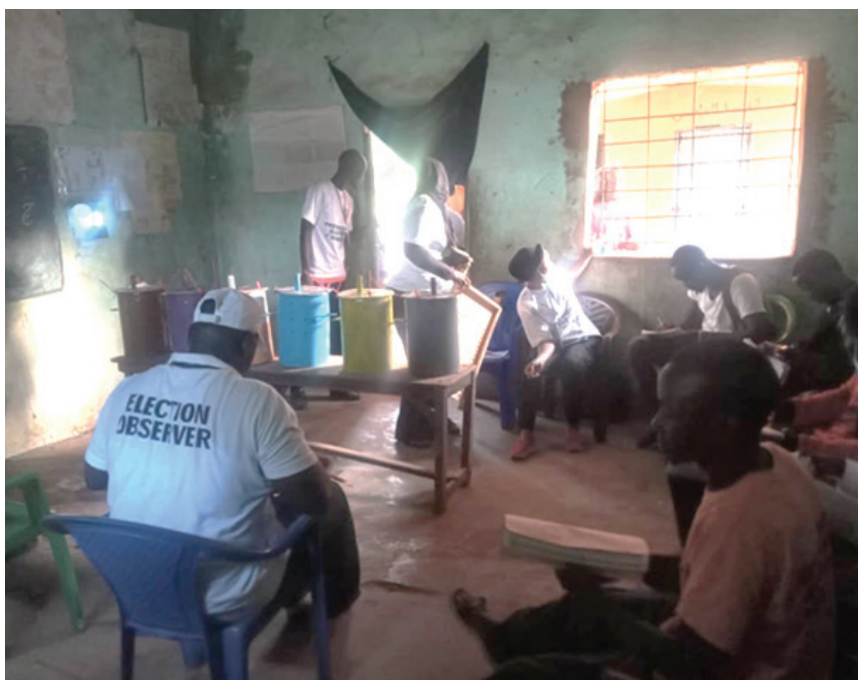
Polling booth at Sanimentereng