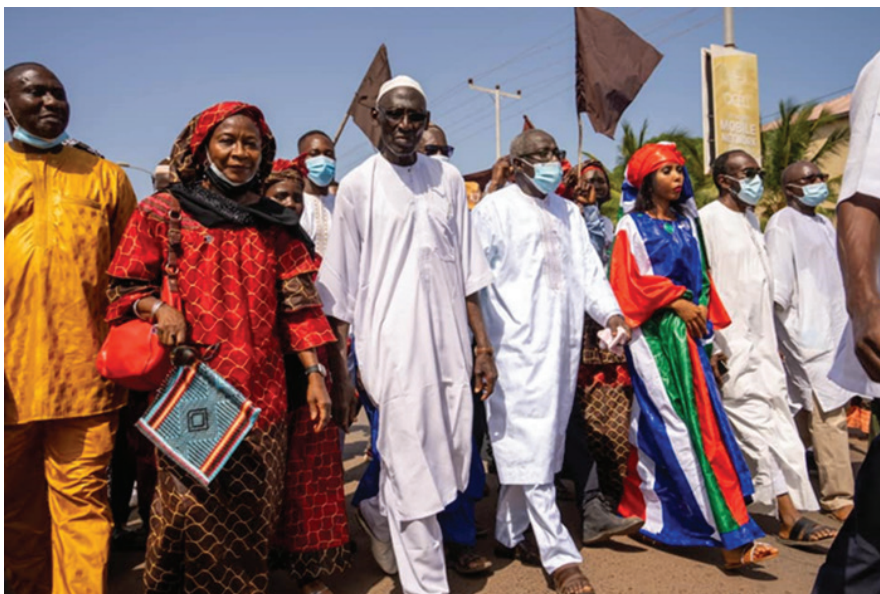
Honorable Halipha Sallah, Presidential Candiadte for People's Democratic Organisation for Independence and Socialism (PDOIS) with his party officials including women.

Most of the presidential aspirants who submitted their nomination papers to the IEC during the nomination period were accompanied by females. While some aspirants came with few or no females, mostly independent aspirants, others came with over 40% percent female representation.