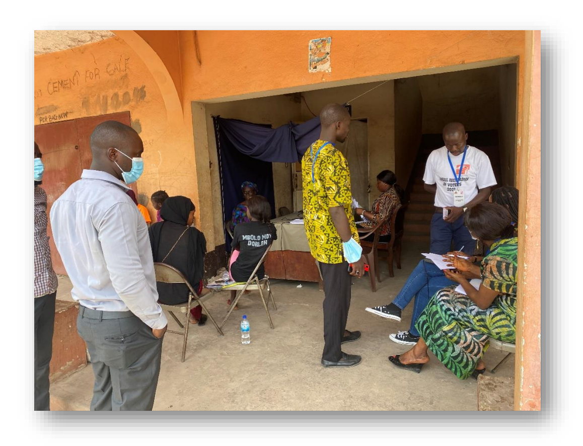
Monitoring Team led by Vice Chairperson at Odeon Square (Cinema), Banjul