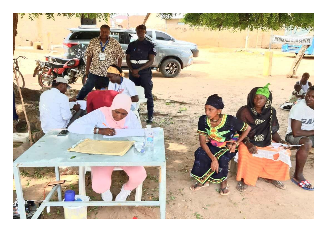
Monitoring team accompanied by the Chairperson in Upper River Region.

Furthermore, at Fass Njaga Choi, the Centre is located inside the village market with market stalls serving as workstations for the registration team. There were many tailoring shops nearby which were causing a lot of noise.