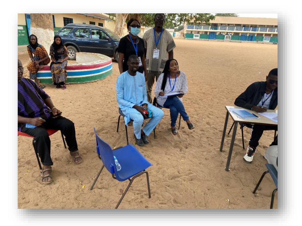
Team A interviewing Supervisor at Latrikunda Sabiji (Plasas Annex Basic School)